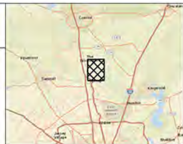
VICINITY MAP Scale: 1 inch equals 10 miles